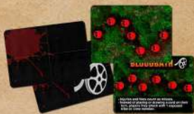
14 Encounter cards