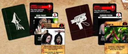
60 Native cards & 60 Film Crew cards