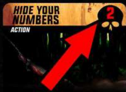
This card's rage cost is 2.

Rage is the currency of Ferox. All cards have a rage cost printed in the top-right hand corner. In order to play a card, you must first pay its rage cost by paying the appropriate number of rage tokens to your opponent.