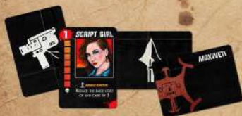
6 Crew Member cards & 4 Tribe cards